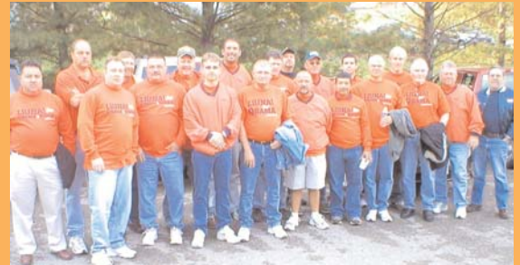
With Virginia Coming Down to the Wire, West Virginia Laborer Volunteers Poured into Roanoke to Tip the State Toward Obama

The Mid-Atlantic Laborers mobilized as never before this election, putting more than one hundred phone bankers and precinct walkers on the streets every weekend from Labor Day to Election Day. And their action paid off - we defended Pennsylvania from a last-minute McCain assault and made history by picking up Virginia for Obama, the first Democrat to win the Commonwealth since Lyndon Johnson!